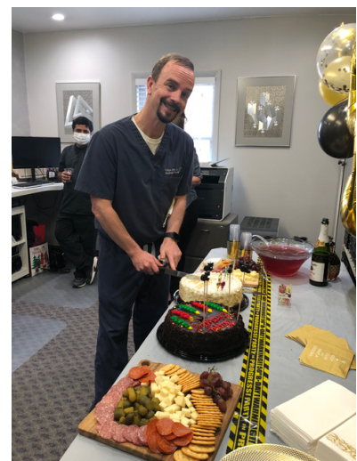
Surprise birthday party for me at the office.