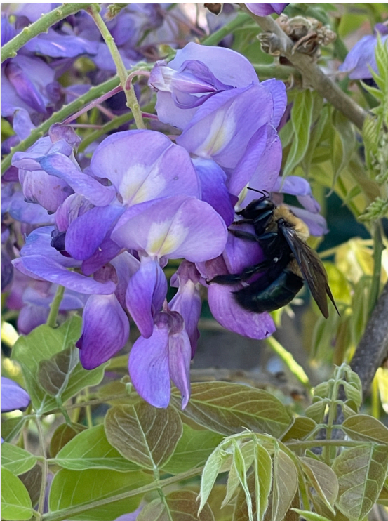
Wisteria (symbolizes long-life)