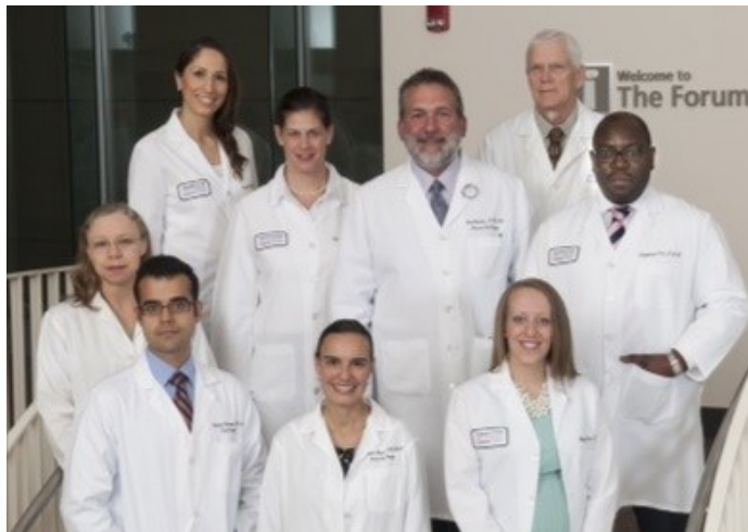
Department of Head and Neck Surgery, Section of Oral Oncology and Maxillofacial Prosthodontics The University of Texas, July 2014: