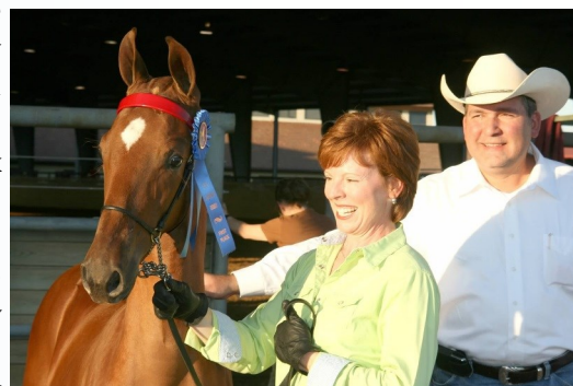
Chambers' Wild Commander, American Saddlebred Weanling, winning the Texas Equine Futurity Competition.

Q: What training or experiences have led you to become a dentist and eventually a maxillofacial prosthodontist?